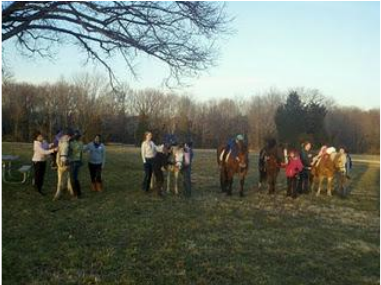
First trail rides and some sunshine.