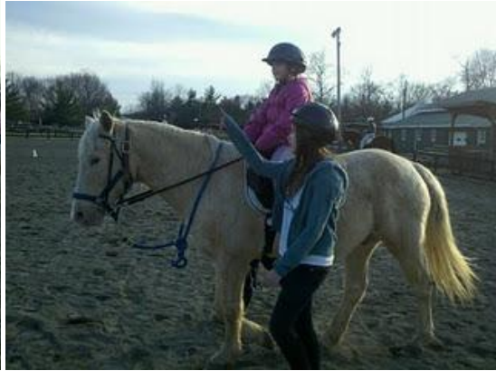
Cold but fun!