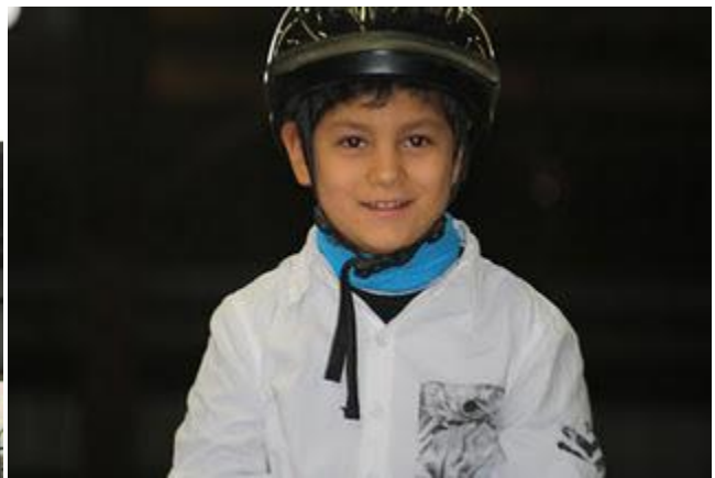
10/22 - Ride For Spirit event