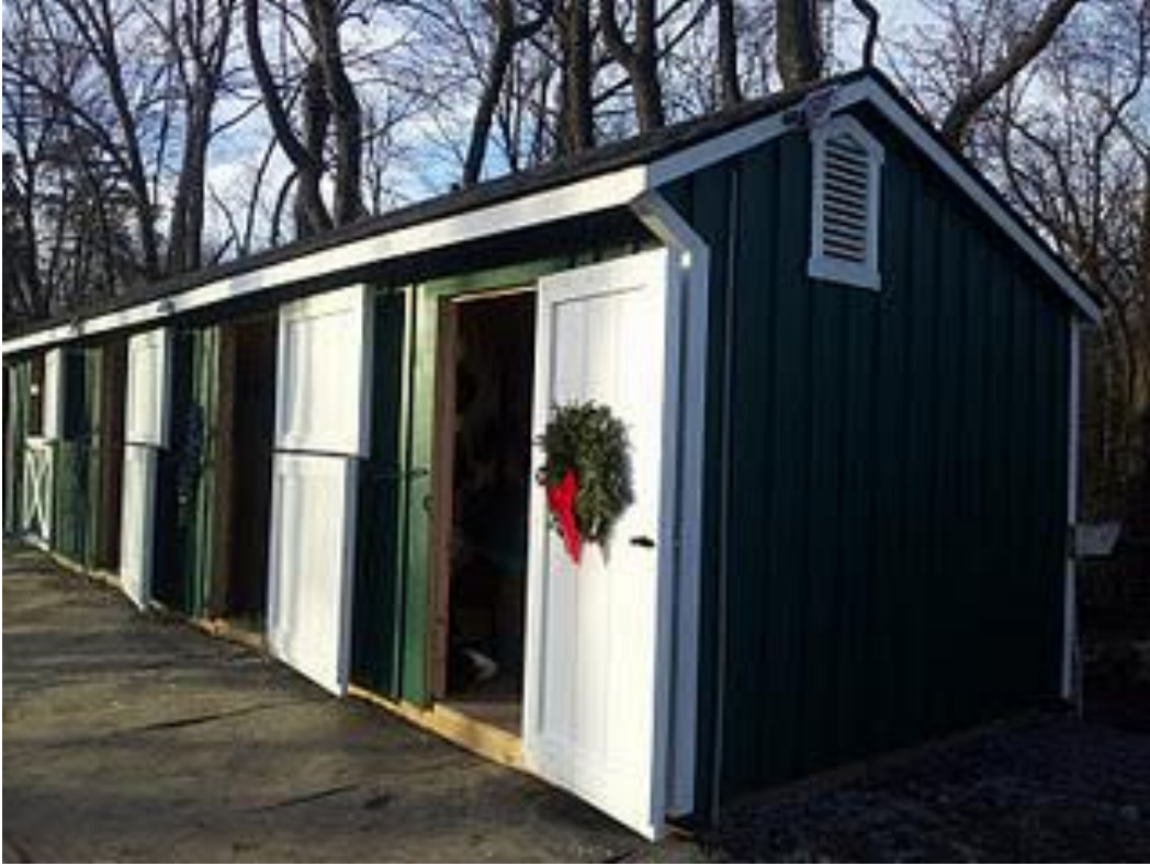
At the end of the year, 12/30/2011, we painted new barn and Spirit is first time, ready for winter, with warm stalls, and dry field.