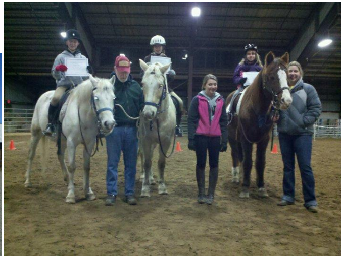
First Classes with FFPF